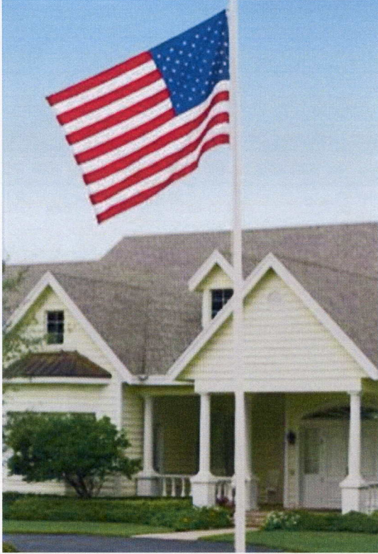
"In the time I have left I plan to continue to fly the American flag without